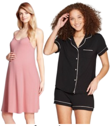
comfy and easy access pajamas